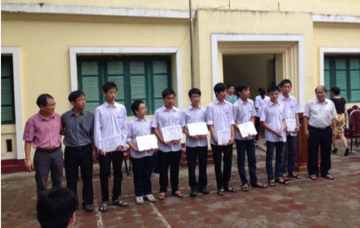
Representatives of 12 students have been awarded scholarships at Tong hop High School (Hanoi) on 29 Sep 2014.