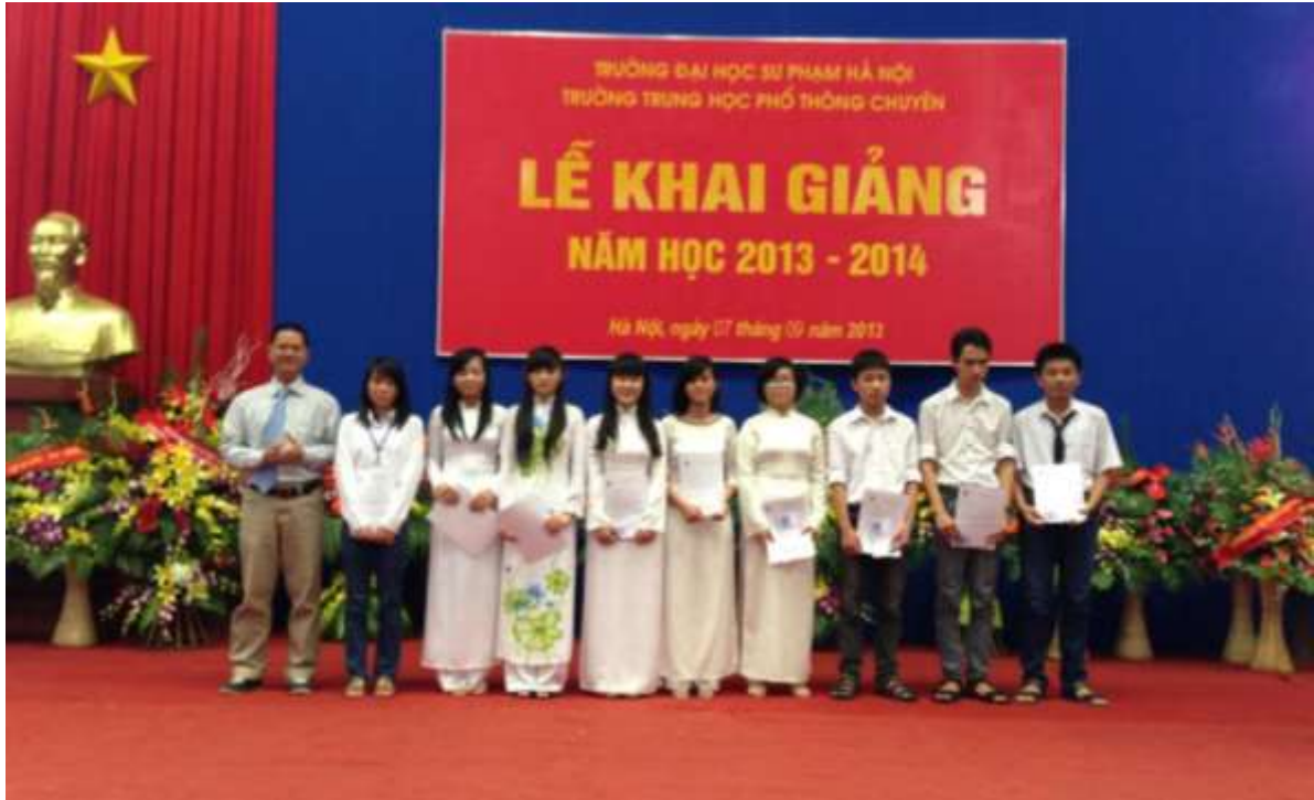
9 students have been awarded scholarships at Su Pham High School (Hanoi) at the NSYOC on 7 Sep 2013