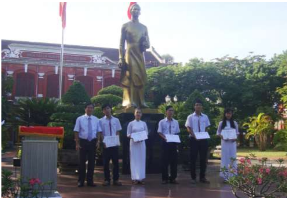
5 students have been awarded scholarships at Quoc Hoc High School (Hue) at the NSYOC on 9 Sep 2013