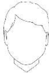
Đào Cao Thái